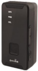
Queclink GL300 series