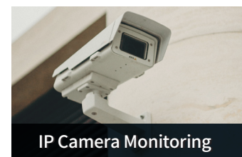
IP Camera Monitoring