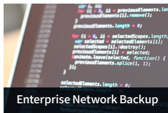
Enterprise Network Backup